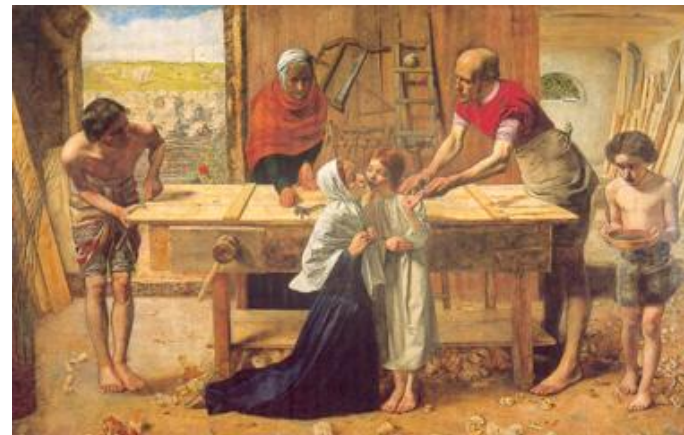
Die hl. Familie