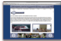
Activities • News

STARTING WITH THE END OF THIS YEAR THE „ACTIVITIES SECTION“ OF 2012 WILL MOVE TO THE „ACTIVITIES ARCHIVE“ TO MAKE ROOM FOR THE NEXT YEAR.